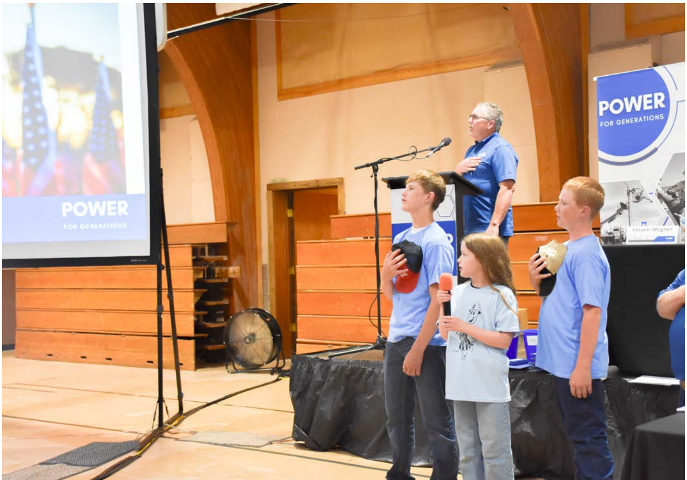
The Slope and Adams County 4-H Livestock Judging Team lead the membership in the Pledge of Allegiance.

joined delegates from across the state and nation to learn from and about each other, while participating in events that showcase our nation's rich history, U.S. government, the cooperative business model and rural electrification.