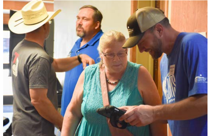
Employees help register members at the annual meeting.

Slope Electric annually awards one $500 scholarship to a graduating senior from each of the high schools within its service area. The