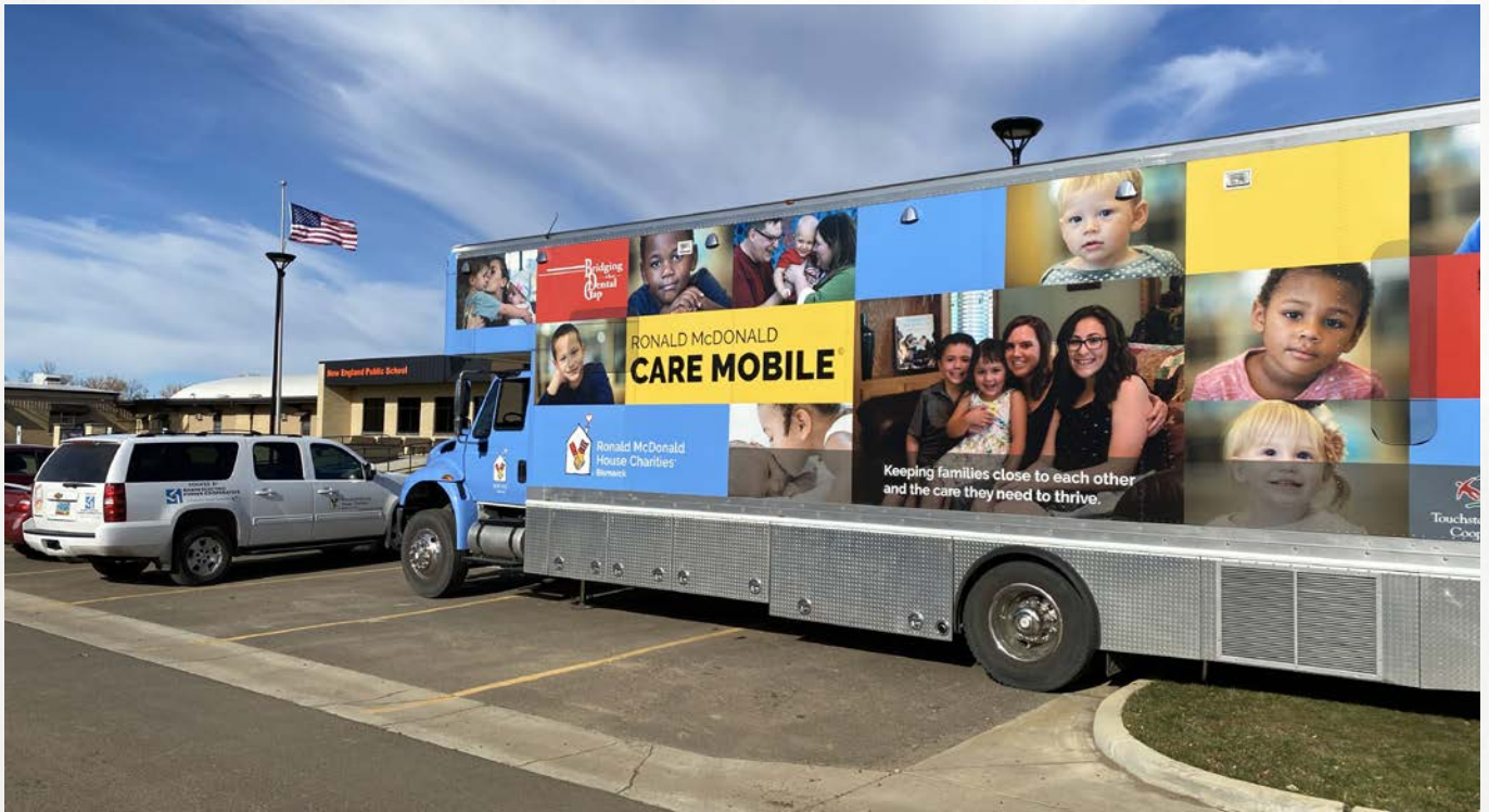
The Ronald McDonald Care Mobile made a stop at the New England Public School last month.