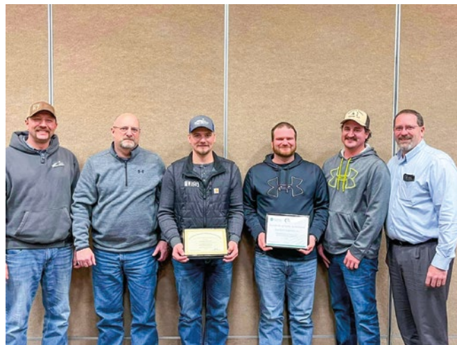
Slope Electric Cooperative employees accept a safety award on behalf of the cooperative.