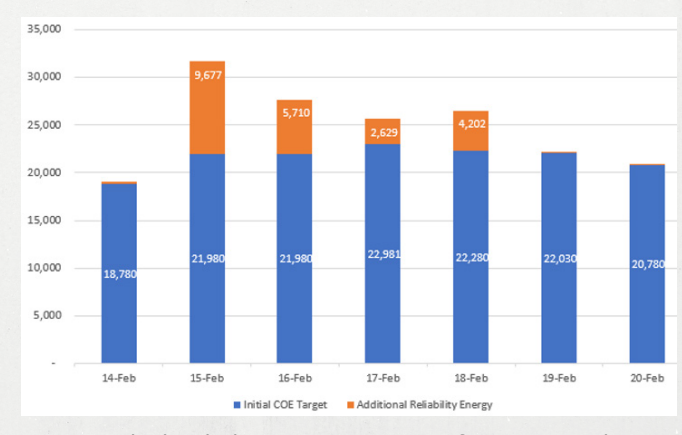
WAPA worked with the U.S. Army Corps of Engineers Feb. 15 to 18 to increase generation from the Missouri River power plants to support the grid. This graph shows the additional hydropower that the Corps provided during Winter Storm Uri.

With the support of our customers and communities, we can achieve balance in a changing world and make our way toward a successful and prosperous future.