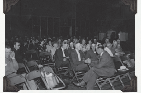
Members in attendance.