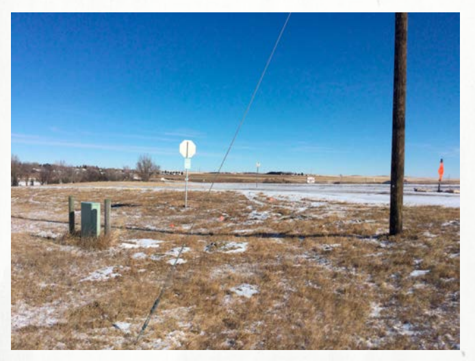
BEFORE: a missing guy wire marker

of finding a problem and prepping the pole in the daylight, it improves safety and outage time."