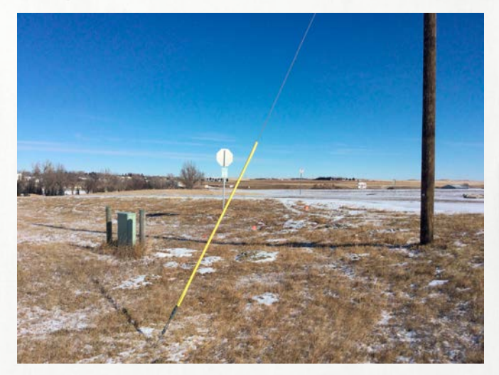
AFTER: a quick repair that adds visibility and protection.

We try to prevent unplanned outages by making sure everything is in good working order for years to come. As we know, Mother Nature can blow an 80-mile-anhour wind storm like the one we had in January and