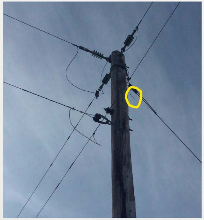
The yellow circle shows a broken ground wire; it was spotted on line patrol and corrected before the system became compromised and an outage occurred.