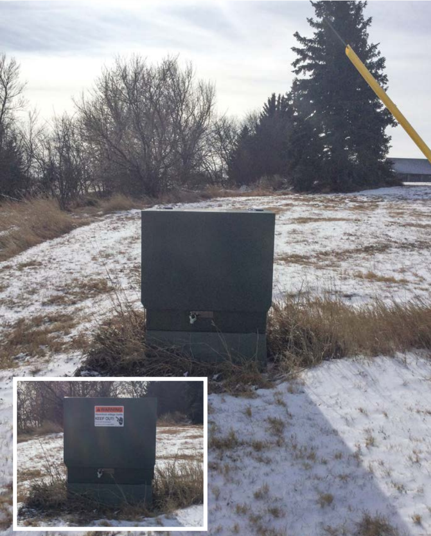
This photo shows how a strong North Dakota wind can deteriorate and remove cabinet signage over time. The missing safety reminder, spotted on line patrol, is quickly corrected (see inset) to remind the public of a possible danger. Always keep a safe distance from electrical infrastructure!