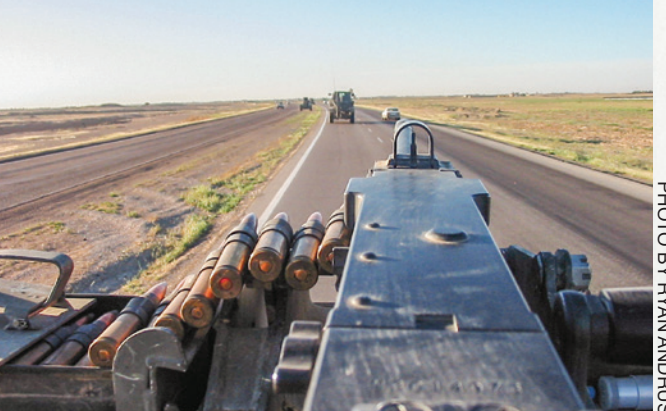
Looking down the barrel of weapon while on a mission.

They converted the design from paper to armored steel, and made two turrets with a bullet-protection system. Tsyver, who worked in maintenance, was in the position to make seven more.