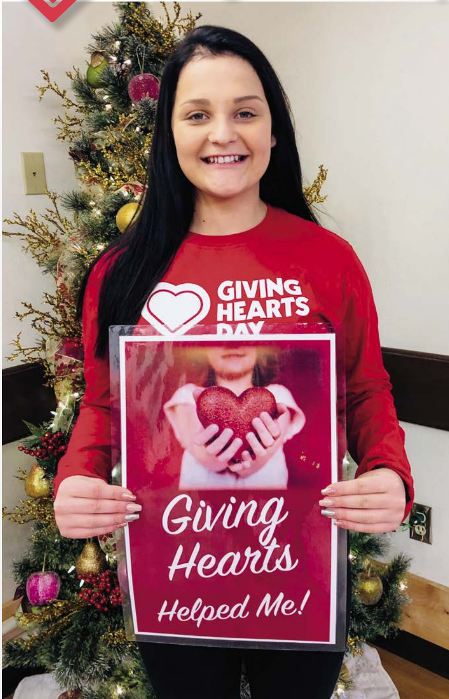
Giving Hearts Day helps raise funds for the Sunrise Foundation's graduating senior health care scholarship.