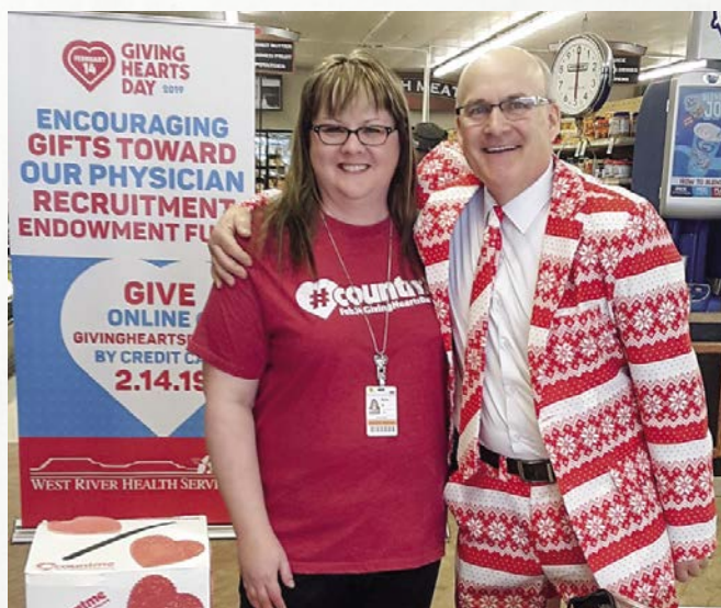
The funds raised on Giving Hearts Day help the Healthcare Heroes Endowment.

“During Giving Hearts Day, the funds that