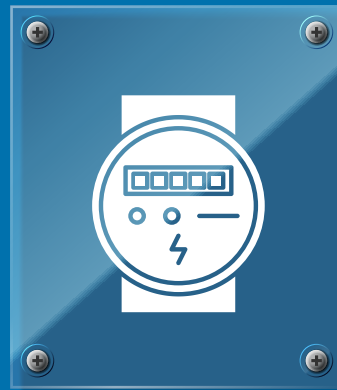
Energy used each hour the appliance is on